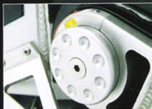
The MTT Superbike takes aero-engined motorcycles into the 21st century.