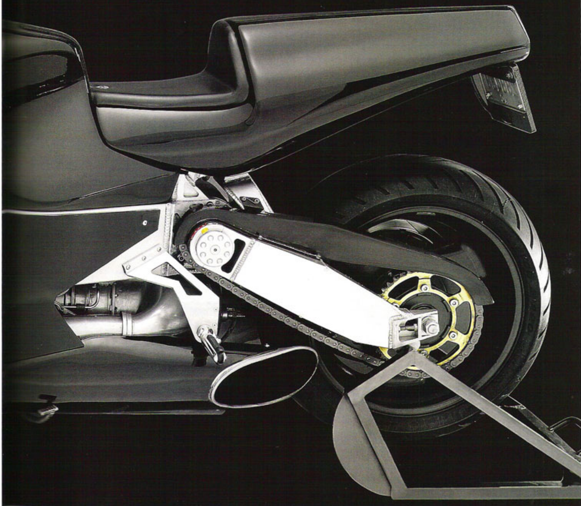
MOTORCYCLE COURTESY OF JAY LENO

Since maximum torque and horsepower are developed at only 3,000 rpm of its output shaft, the Superbike requires only two gears in its custom-built transmission. This